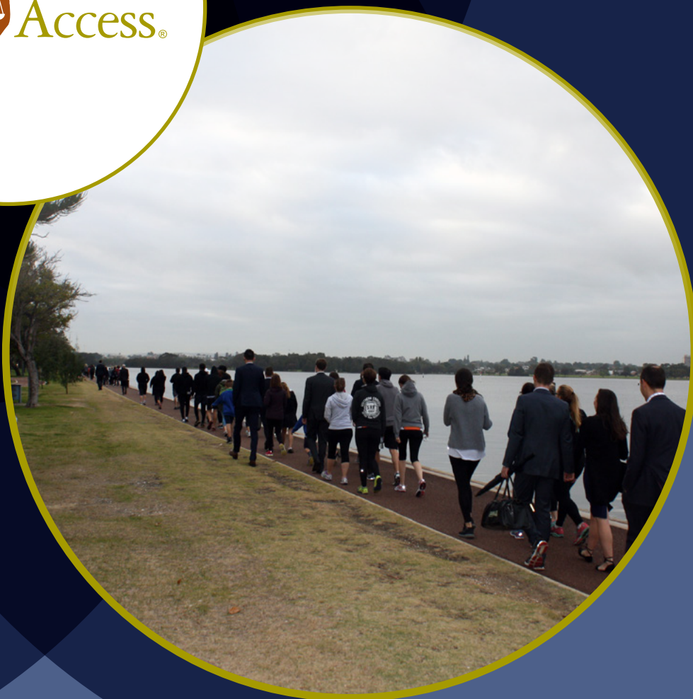
Photo above: Law Access supporters take part in the Inaugural Law Access Walk for justice 17 May 2016.